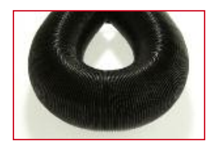
APK marine hot air ducting