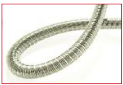
Flexible stainless steel flue pipe