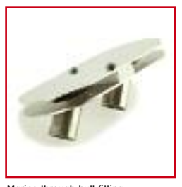
Marine through hull fitting