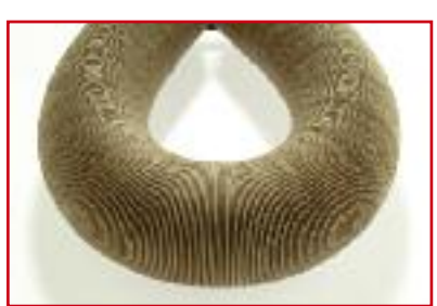
Caraflex vehicle hot air ducting